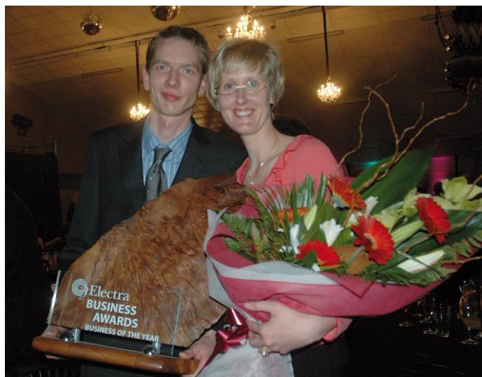
2008 Electra Business of the Year winner CBS Ltd