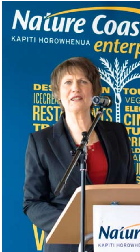
Hon Helen Clark speaking at the recent Nature Coast Enterprise lunch held at the Paraparaumu Beach Golf Club